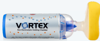
VORTEX with Pediatric Mask, Med 1.5 - 4 years Part No.: 051F8200 HCPCS No.: A4627