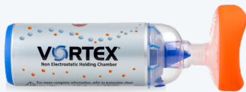
VORTEX with Pediatric Mask, Sm 0 - 1.5 years Part No.: 051F8100 HCPCS No.: A4627