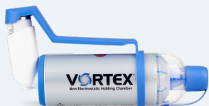
One-Handed Operation Aid Part No.: 044F5100