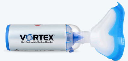
VORTEX with Adult Mask 4 years and up Part No.: 051F8300 HCPCS No.: A4627