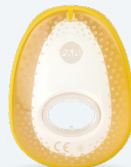
VORTEX Pediatric Mask, Med 1.5 - 4 years Part No.: 044F8200